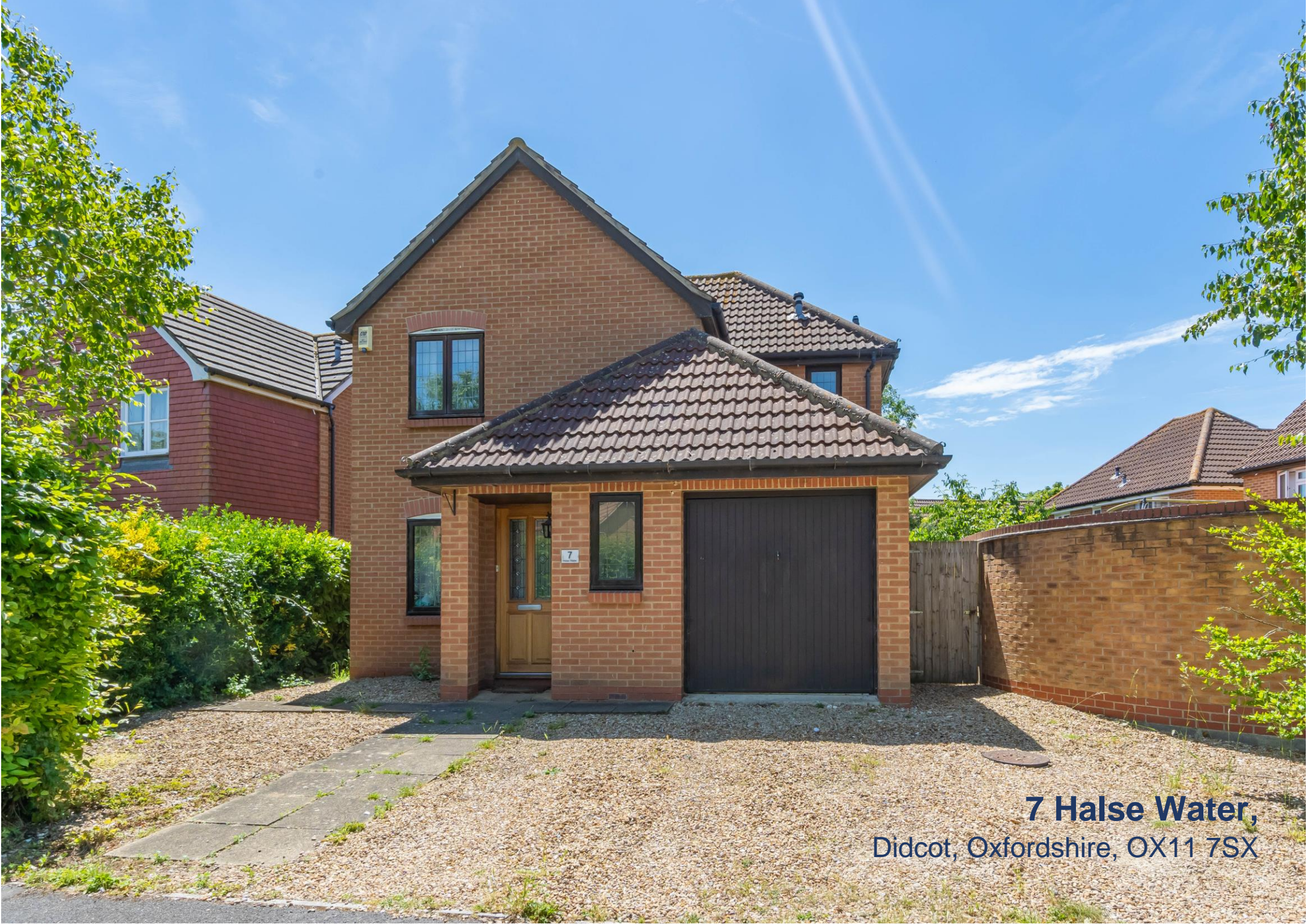
7 Halse Water, Didcot, Oxfordshire, OX11 7SX